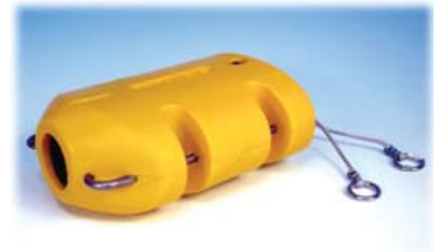
Cod End Mounted NFS-740 Catch Sensor